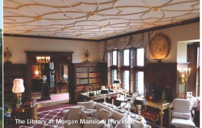
The Library at Morgan Mansion, Princeton