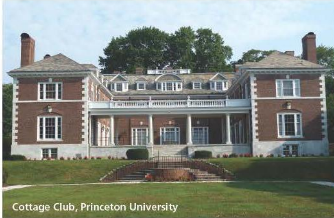
Cottage Club, Princeton University

Artisan Painter and Restoration Contractor